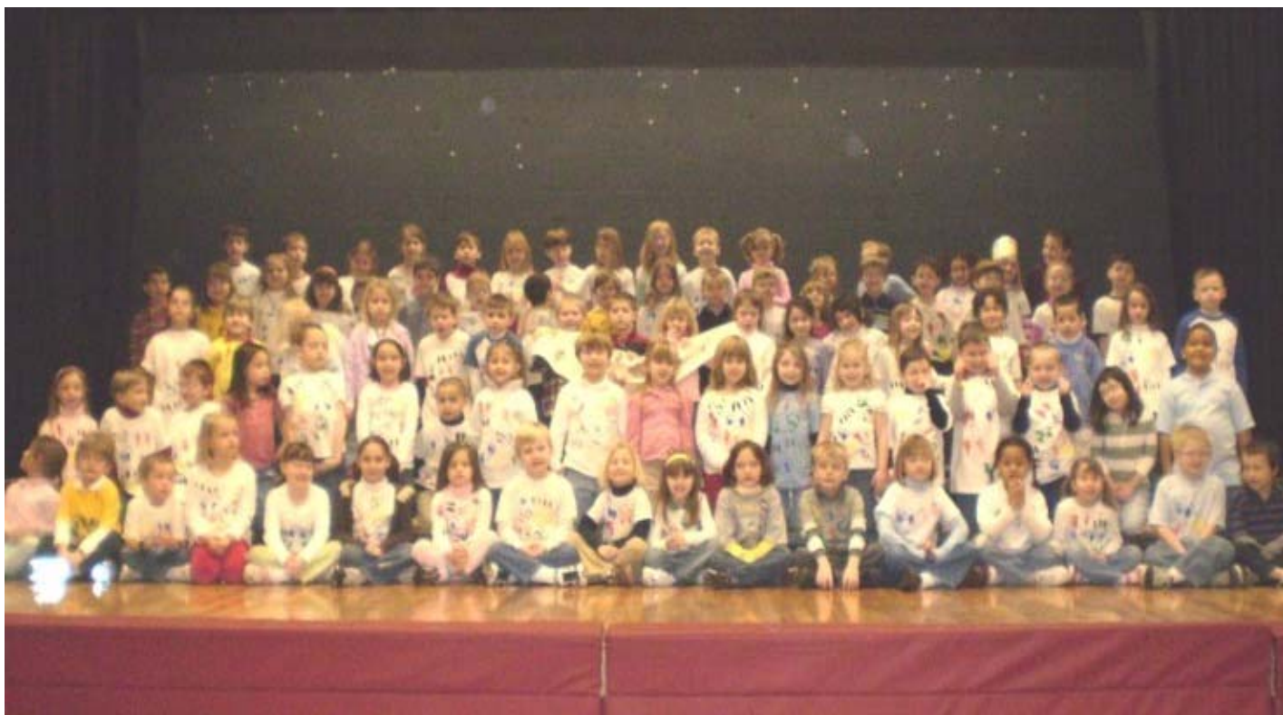
All five kindergarten classes at Lackawanna Trail Elementary School wearing their animal tracks T-shirts.