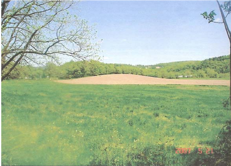
Stitzinger Farm soon to be preserved (approximately 350 acres).

Many of us would agree that Wyoming County is a very beautiful place to live. No matter where we travel, we are privileged to enjoy scenic farmland, sparkling streams, beautiful trees, bountiful wildlife, plentiful open space, and a seemingly endless supply of space to roam free.